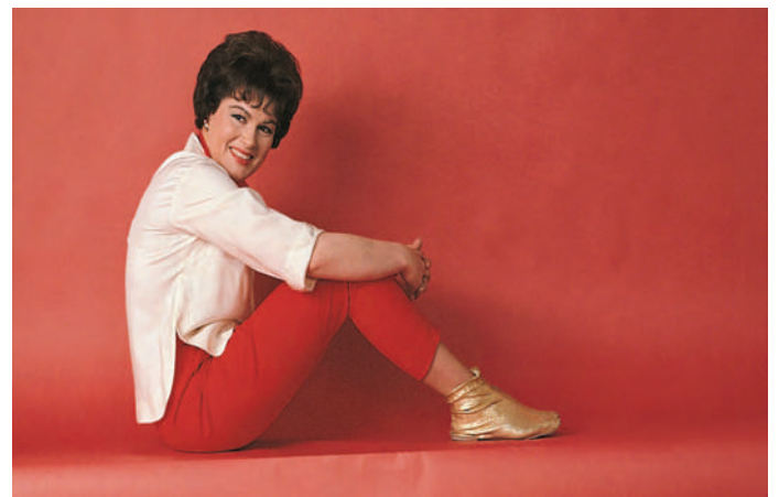
Patsy Cline: American Masters Aug. 29 at 8:30 p.m.