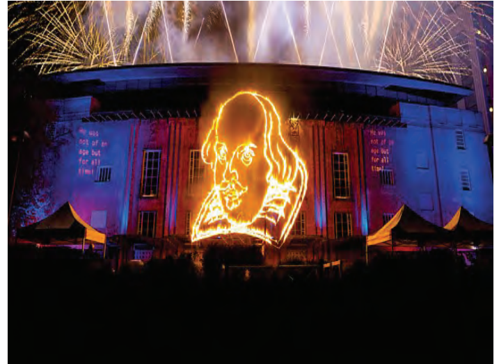
Shakespeare Live! From the RSC Aug. 11 at 8:00 p.m.