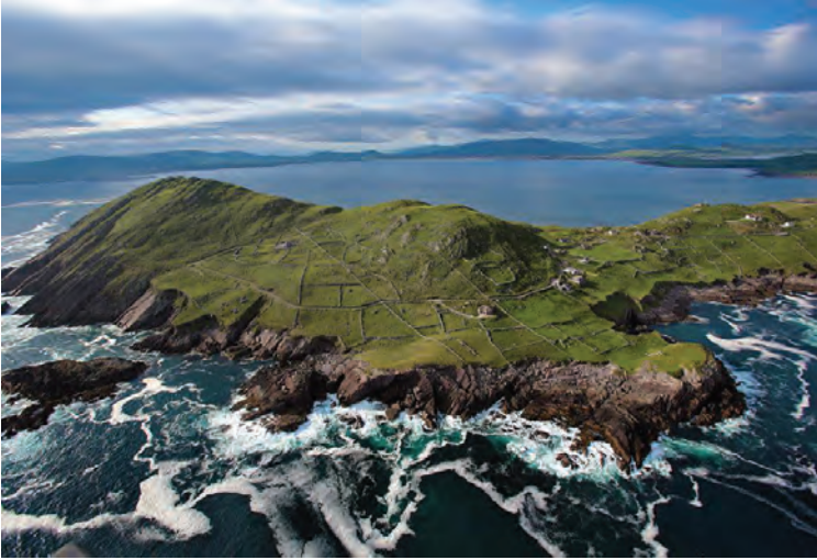
Ireland's Wild Coast Aug. 2 at 7:00 p.m.